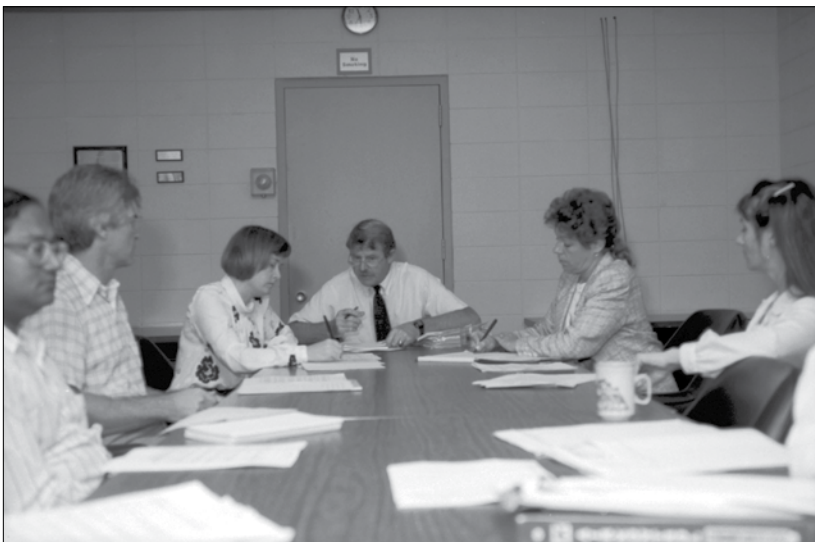
Executive Committee meeting (June 1990)